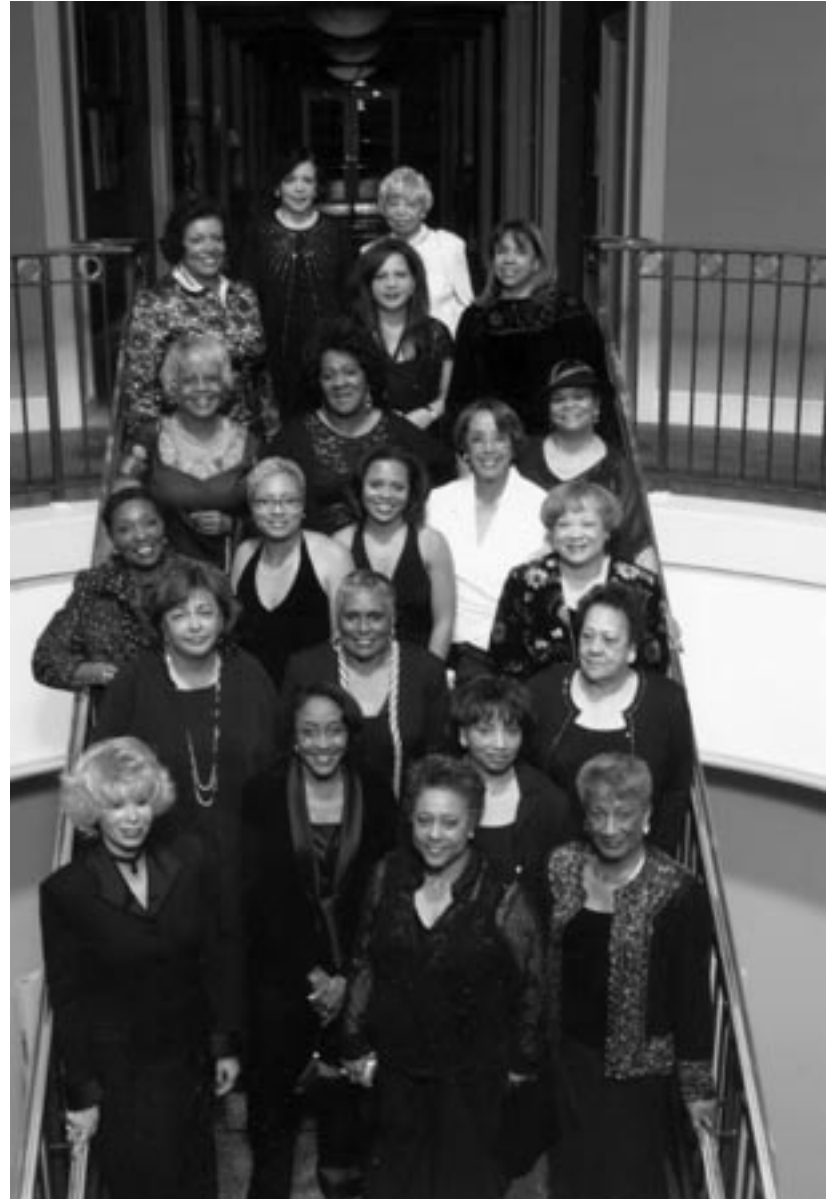
Delta Alpha Archousai