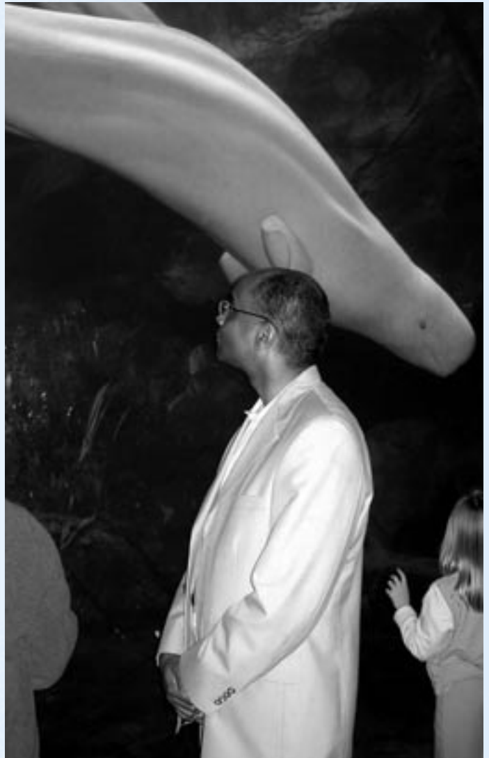
Scenes from the aquarium