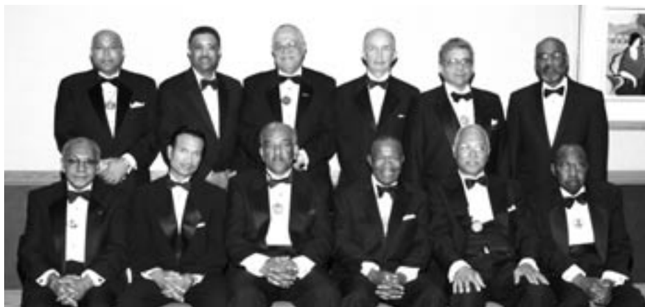
Sigma Pi Phi National and Regional Officers