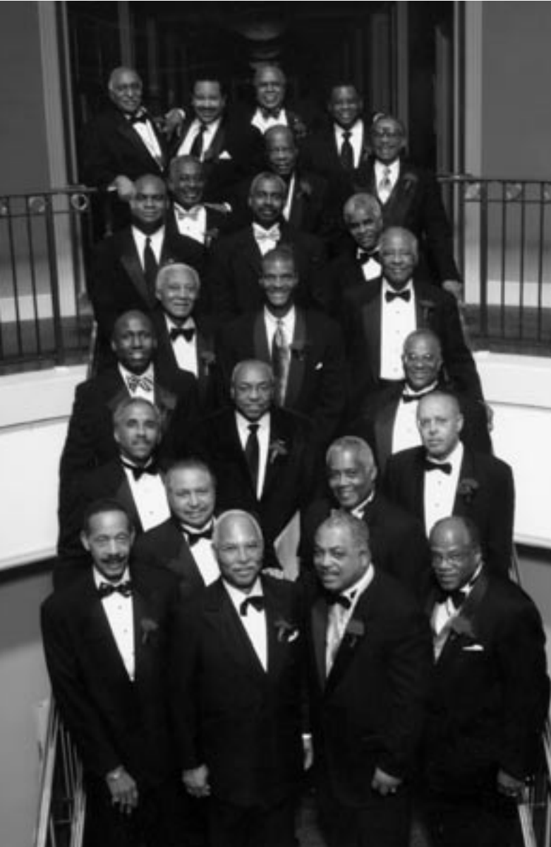
Delta Alpha Archons