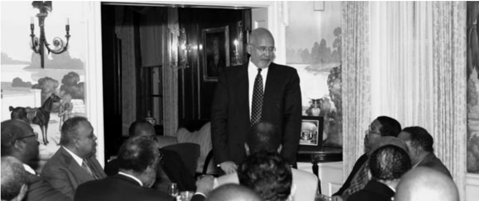
Dr. Herbert speaks to group.