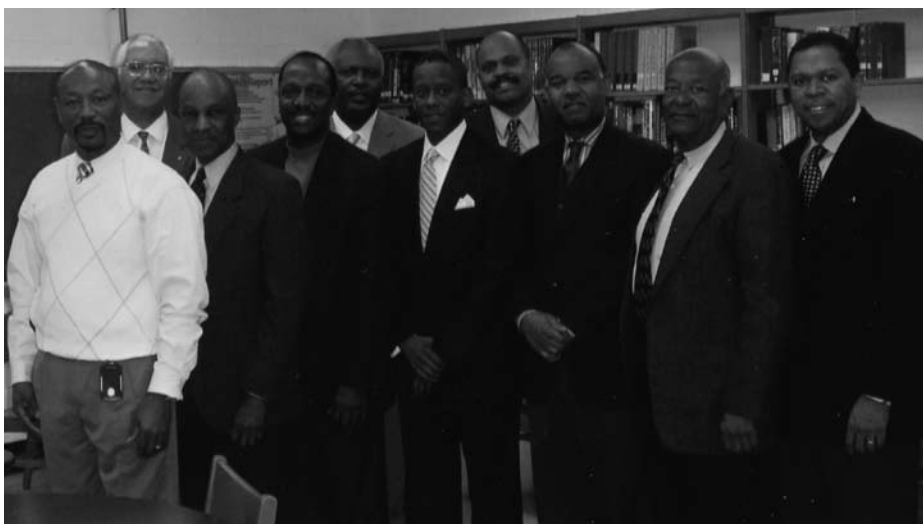
Alpha Beta Archons